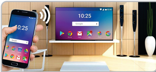
SCREEN MIRRORING FEATURE