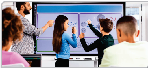
20 POINT TOUCH | SPLIT SCREEN SIMULTANEOUS MULTI USER